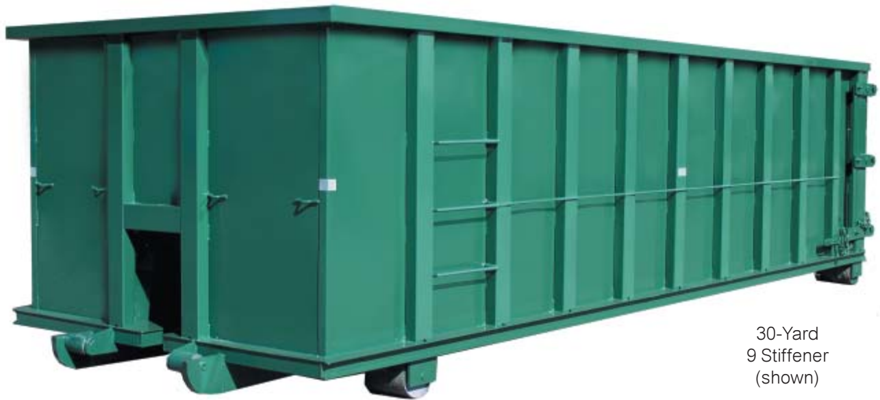
30-Yard 9 Stiffener (shown)